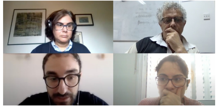
FROM THE ONLINE TRANSNATIONAL MEETING ON TUESDAY 7 APRIL 2020

"Despite the recognition that cultural and creative industries can foster significant economic potential and are one of Europe's most dynamic sectors, contributing to the creation of millions of jobs across the European Union, there is a noticeable lack of cultural and arts entrepreneurship programmes of study. The project CREATION (Cultural and Arts Entrepreneurship in Adult Education), funded under Erasmus+ Strategic Partnerships for adult education, seeks to redress this situation through the development of a framework for adult education for the creative and cultural sectors across Europe, with a specific focus on aspiring women entrepreneurs from marginalised backgrounds (migrants, refugees and asylum seekers). This study provides a needs analysis to inform the identification of the required educational needs for the target groups. It comprises desk research of the related literature plus online survey data. Synthesis of the prominent themes that emerged from this study indicates the need for a multifaceted instructional design approach that combines both the essential generic skills in entrepreneurship and acknowledges the structural, contextual and educational challenges that are characteristic of the target groups."